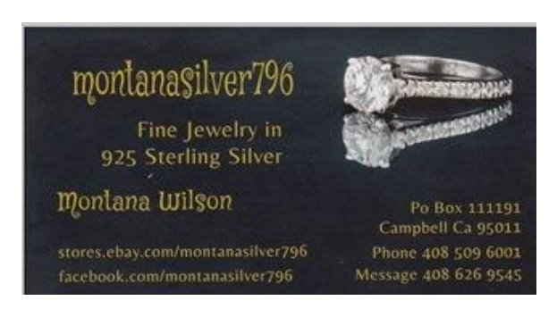
Montana Silver 796