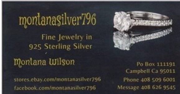
Montana Silver 796