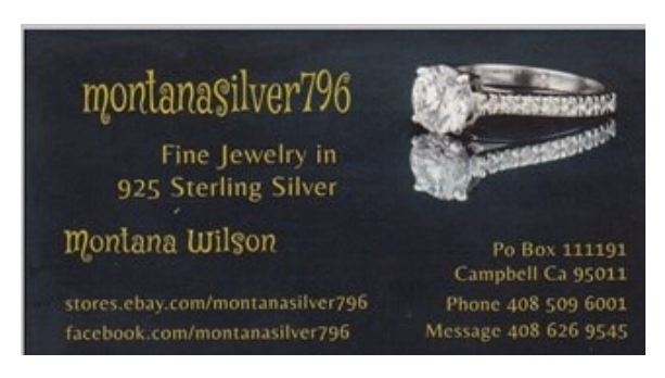
Montana Silver 796