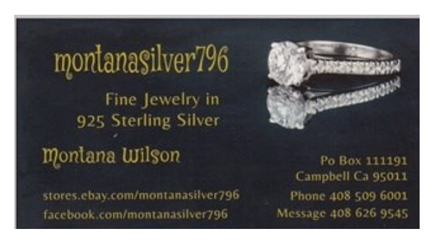
Montana Silver 796