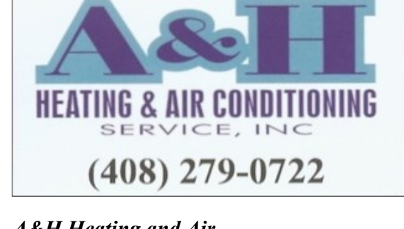
A&H Heating and Air