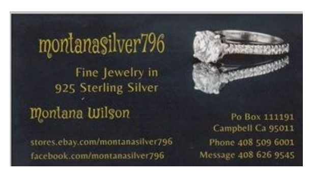
Montana Silver 796