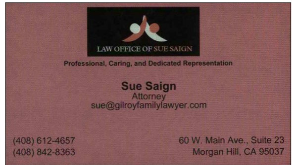
Sue Saign Family Law