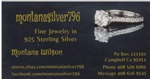
Montana Silver 796