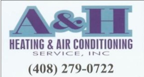
A&H Heating and Air