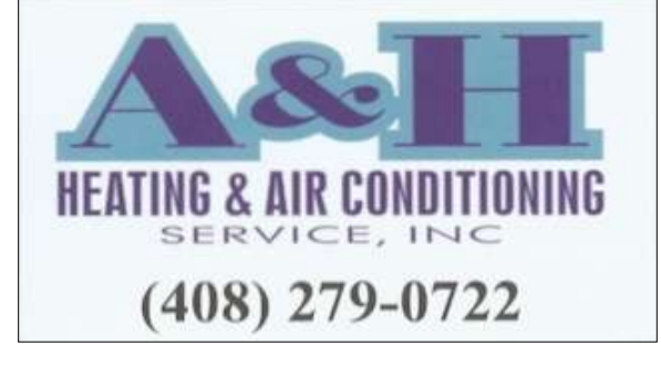
A&H Heating and Air