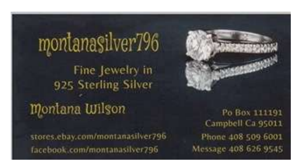
Montana Silver 796