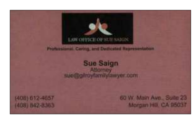
Sue Saign Family Law