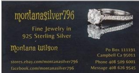
Montana Silver 796