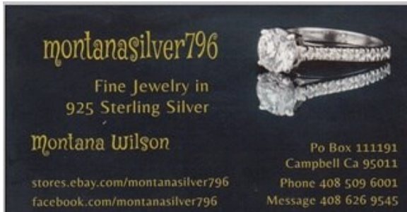
Montana Silver 796