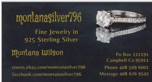
Montana Silver 796