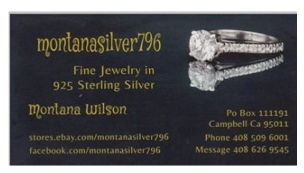
Montana Silver 796