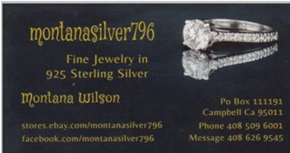
Montana Silver 796