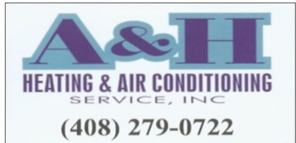
A&H Heating and Air