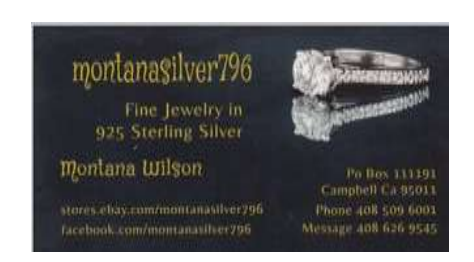
Montana Silver 796