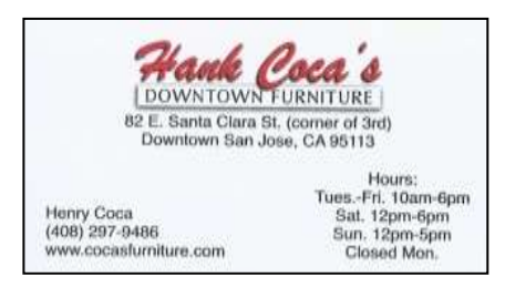
Hank Coca's Downtown Furniture