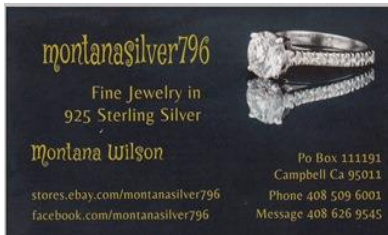
Montana Silver 796