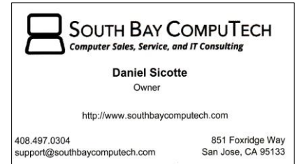
South Bay CompuTech