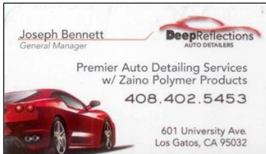
Deep Reflections Auto Detailing