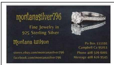
Montana Silver 796