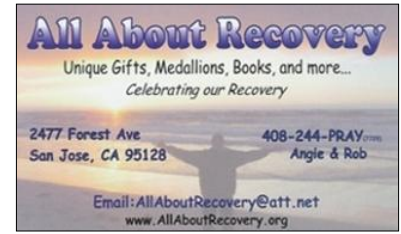
All About Recovery