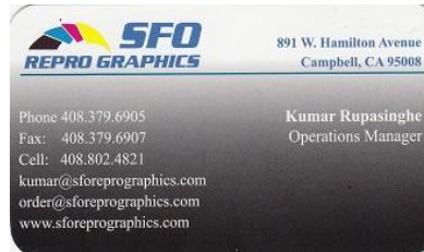
SFO Repro Graphics