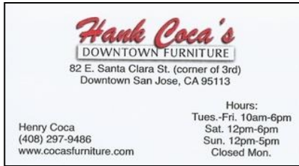
Hank Coca's Downtown Furniture