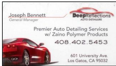
Deep Reflections Auto Detailing