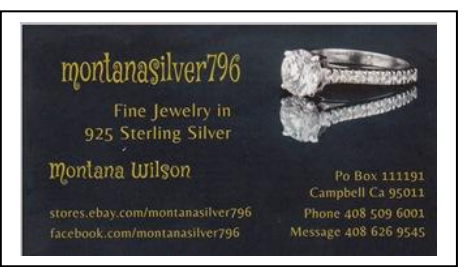
Montana Silver 796