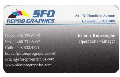
SFO Repro Graphics