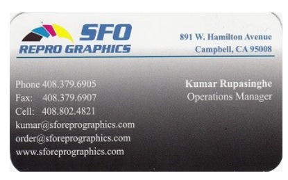
SFO Repro Graphics