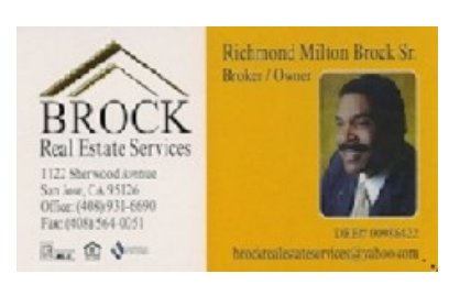
Brock Real Estate Services