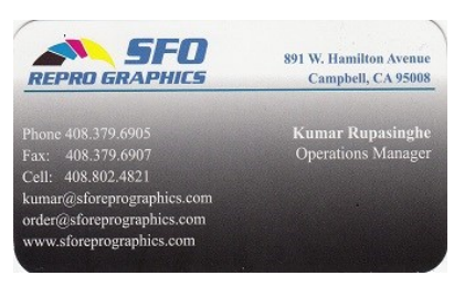
SFO Repro Graphics