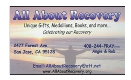
All About Recovery