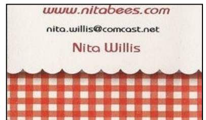
Nita Bee's Specialty Bakery