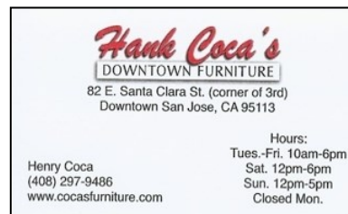
Hank Coca's Downtown Furniture