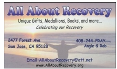
All About Recovery