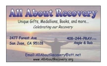
All About Recovery